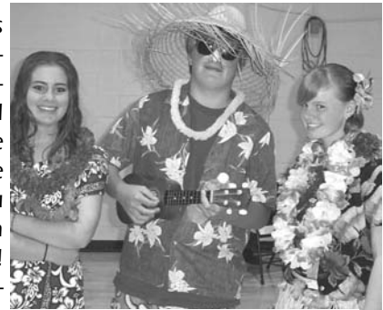
ALOHA! Hawaiian Day

Midway's traditional Spirit Week has never looked so good! Our school rallied together for a great time, awesome competitions, and a crazy all night roller skate party. It was a huge success! But, we could not have done it without everyone's help. Thank you to the students for participating and, in some cases, going to the extreme! Thank you to the parents who supported our school's fundraising efforts. Thank you also for allowing your children to come to school looking so silly! Wait. Don't think those costumes are wasted! You can reuse your costumes on Halloween night, Sunday, October 31, 6-9 p.m., at Midway Baptist Church's Family Fun Festival. There will be Trunk-or-Treating, a 75 foot Tsunami slide, and a mechanical bull. Test your skills at a Search and Rescue competition or in an inflatable obstacle course. There will also be astro jumps, a $75 Vons shopping spree raffle, and lots of carnival games. Admission is free. See you there!