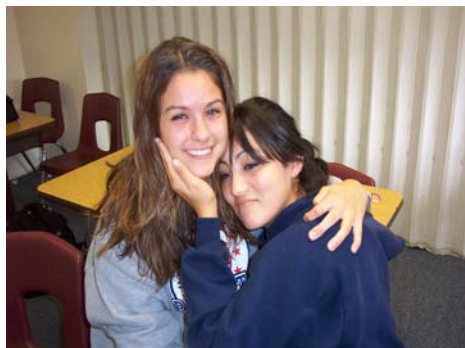
Midway students are COMPASSIONATE!